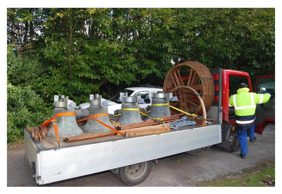
4 of the bells being transported to the foundry for refurbishment

This remarkable DVD narrates the history of our bells, leading up to their restoration in 2008-2009 with footage of their removal from inside the bell tower, the work inside the now-closed Whitechapel Bell Foundry and the bells' eventual return and re-installation.